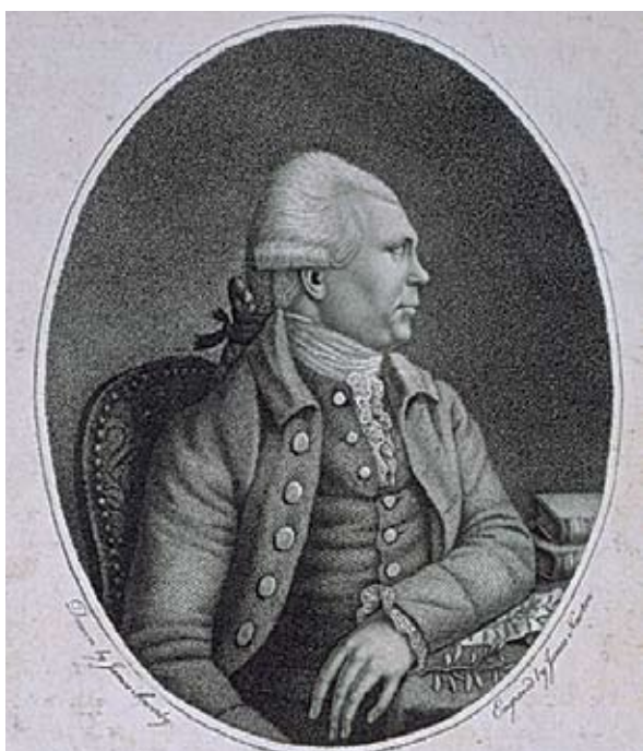
▲ Daniel Solander, 1784

James Petiver was an English apothecary and had many plants and insects collected for him from around the world, but especially from the Caribbean and Americas. His plant specimens alone filled more than 100 bound volumes. As well as building up his 'Museum Petiverianum', he sold duplicates of rare specimens in his collection and 'complete sets' of certain species. Hans Sloane was a friend of James Petiver and bought his collections after his death in 1718. James Petiver's collection is therefore now in the Natural History Museum and his private papers are in the British Library.