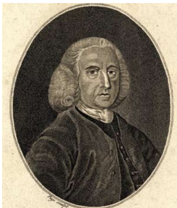
▲ Peter Collinson (1694–1768), Picture Library reference 52076