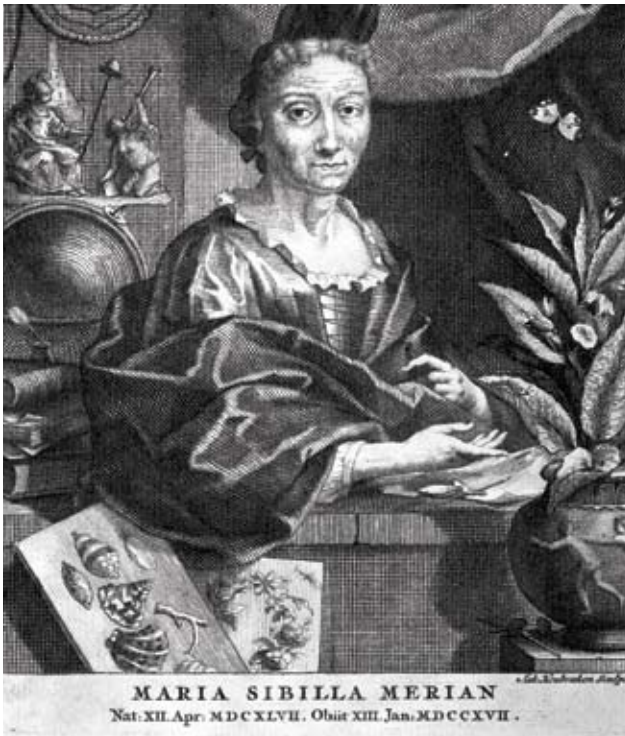
▲ Anna Maria Sibylla Merian (1647–1717)

Maria Merian was born in Germany in 1647 to a family of artists. She lived most of her life in the Netherlands, and died there in 1717. She was a naturalist as well as an artist, and as a child insects fascinated her. Her diaries show she observed how silkworms change (metamorphose) into moths when she was just 13, nine years before this was published in Europe. Previously, it was widely thought that insects were generated from decaying leaf matter.