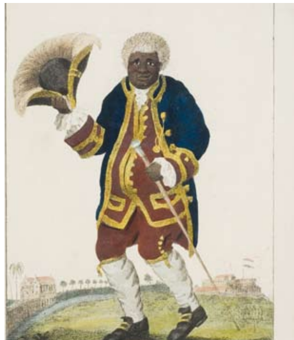
▲ The celebrated Gramman Quacy’, engraving by William Blake, Stedman, 1806