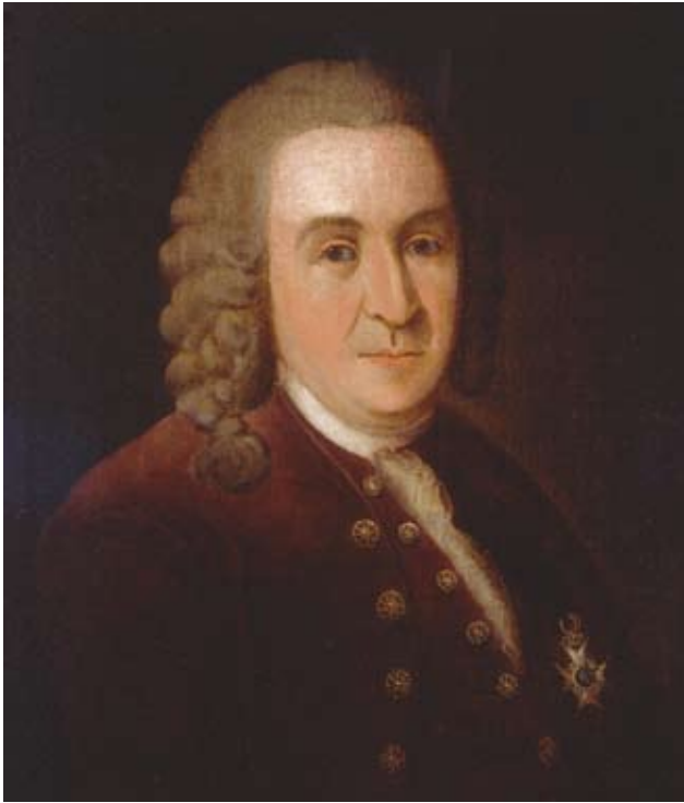
▲ Carl Linnaeus (1707–1778), Picture Library reference 4251 © The Natural History Museum, London

Europeans saw Africa and the Americas as places rich in plants to exploit for profit 4 . Natural historians 5 saw them as places to advance their knowledge of science. In the 1600s collecting natural history specimens was popular and profitable across Europe, especially in Holland and France as well as Britain. These countries had overseas colonies and many specimens were sent back to Europe. Specimens from Africa and the Americas played an important part in the development of botany (plants) and entomology (insects).