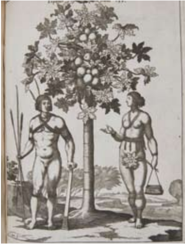
▲ One of the earliest recorded examples of life in the Caribbean (French colonies) Du Tertre, 1671

Some illustrations show representations of indigenous peoples at the time of the transatlantic slave trade, although they are often romanticised.