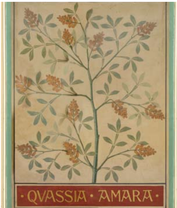
▲ Quassia amara , a decorative ceiling panel from the roof of the Natural History Museum’s Central Hall, Picture Library reference 48863 © The Natural History Museum, London

In 1776, when he was about 80, the ‘celebrated Gramman Quacy’ was sent to The Hague to visit Willem V, Prince of Orange.