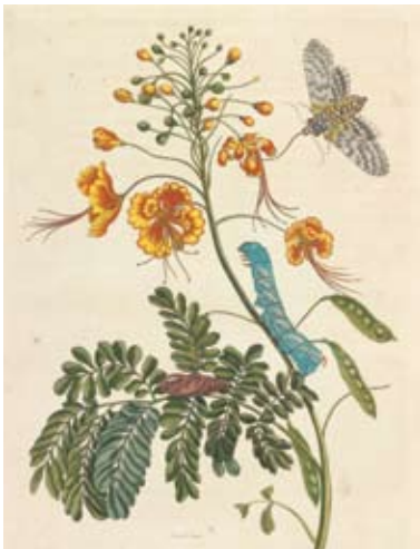
▲ Flos pavonis ( Caesalpinia pulcherrima ), Merian, 1705