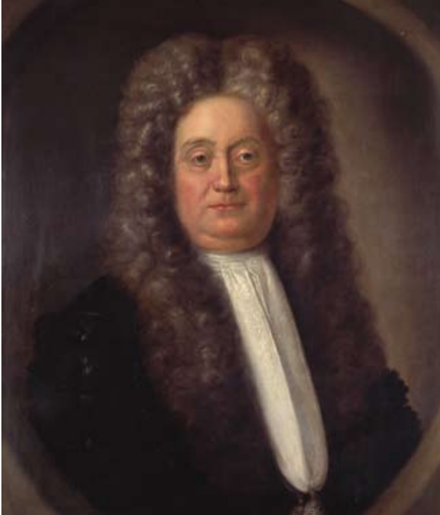
▲ Sir Hans Sloane (1660–1753)

Hans Sloane was born in Ireland in 1660 9 . He died in 1753. He lived in London for most of his life and became a wealthy and popular doctor. His passion was natural history and he collected a huge number of plants and animals, as well as coins. He was President of the Royal Society from 1727 to 1741.