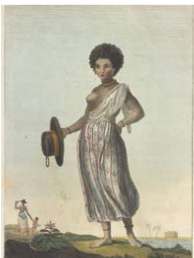
▲ Joanna, Stedman, 1806 35

'Here Joanna introduced me to a venerable old slave, her grandfather, who made me a present of half a dozen fowls. He was grey-headed and blind, but had been comfortably supported for many years through the kind attention of his numerous offspring. He told me he was born in Africa, where he had once been more respected than any of his Surinam masters ever were in their country.' (Stedman, vol 1, 1806, p319)