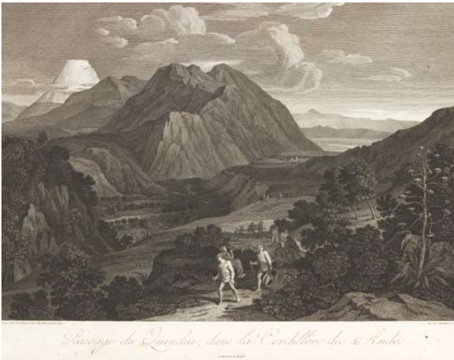
▲ A European being carried 'by man's back', Humboldt, 1816 48

'... brutes are botanists by instinct'. (Long, quoted in Schiebinger, 2004, p82) 49 .