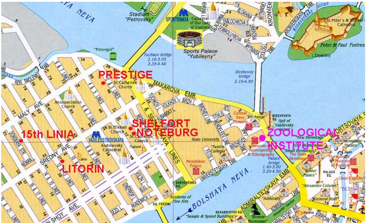
Fig. 2. Surrounding area of the Metro station Vasileostrovskaya and Zoological Institute. Hotels marked in red.

Hotels are near the Metro station Vasileostrovskaya (Fig. 2).