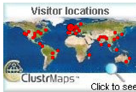
Location of visitors to the website (May-August 2009)

The addition of a visitor statistics tool in May 2009 has provided interesting information on the user base of the website. During the last 4 months the website has had 218 visitors from 33 countries.