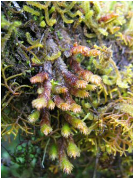
The tropical leafy liverwort Pleurozia gigantea

In September 2008, a team of 17 bryologists, mostly members of the BBS - Tropical Bryology Group, assembled on La Réunion for two weeks to participate in a taxonomic workshop and field meeting hosted by the Université de la Réunion and La Réunion Parc National. The aim of this taxonomic workshop was to bring together bryologists researching the bryophyte flora of the Mascarenes.